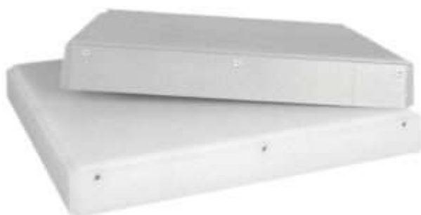
Крышка полиэтиленового блока КСР2501