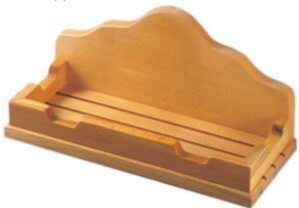
Поддержка отрыва AV4916 Peel support.