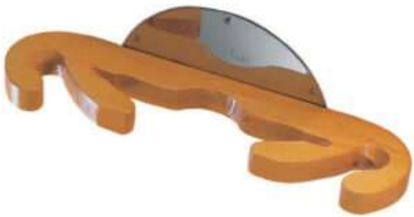
Поддержка отрыва AV4914 Peel support.