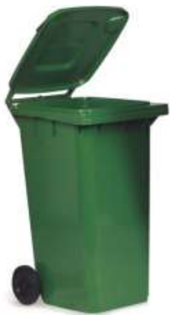
Урны для мусора и пыли AV4676 Polyethylene waste bins. Several colours available.