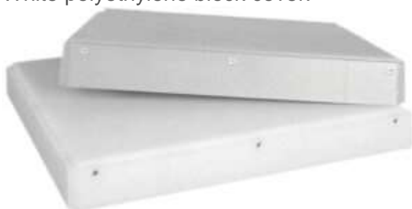
Крышка полиэтиленового блока КСР2502