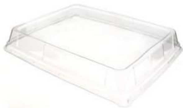
Пластиковая крышка СР4