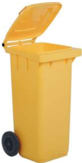
Урны для мусора и пыли AV4678 Polyethylene waste bins. Several colours available.