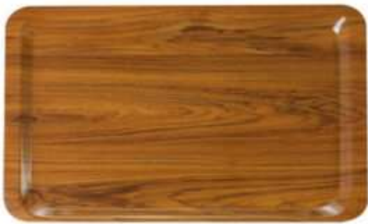
Поднос из тикового ламината AV4586 Teak laminate tray.